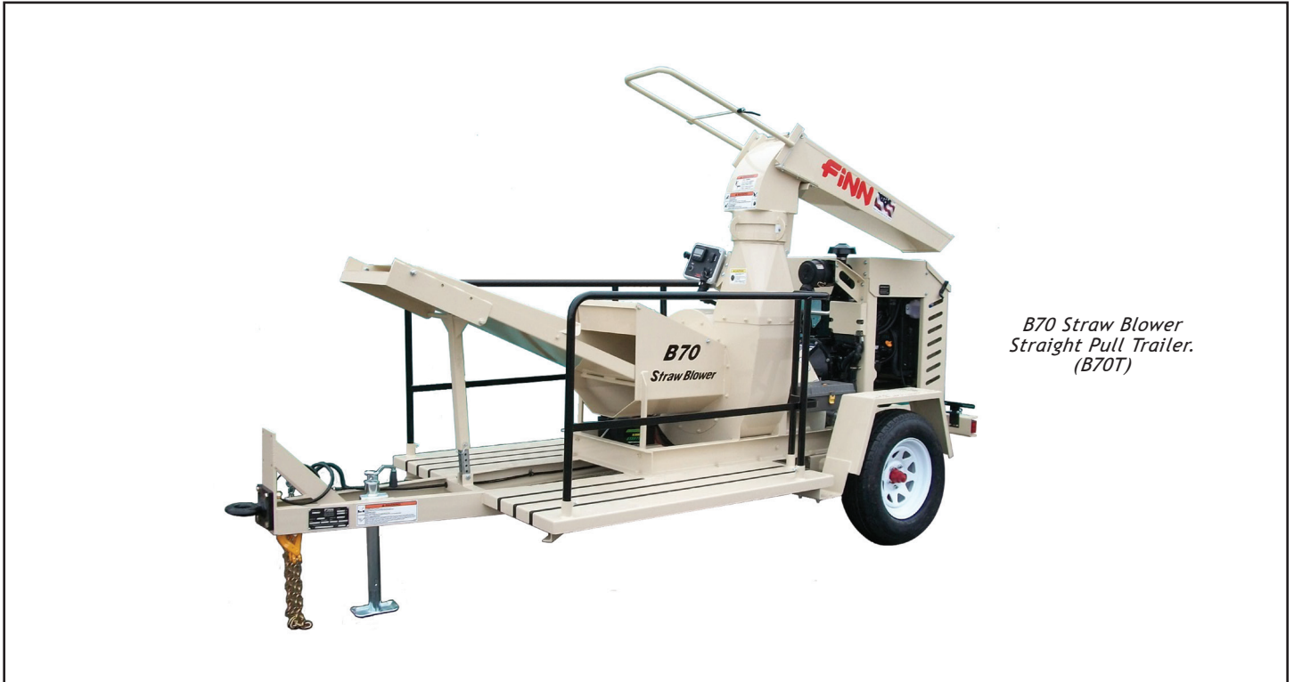
B70 Straw Blower Straight Pull Trailer. (B70T)

The FINN B70 Straw Blower is an ideal performer for all mid-size mulching needs. Designed to handle a wide variety of mulching material, the B70 gives you the high productivity and dependability that is essential for tackling home sites, industrial and commercial projects, and highway roadsides.