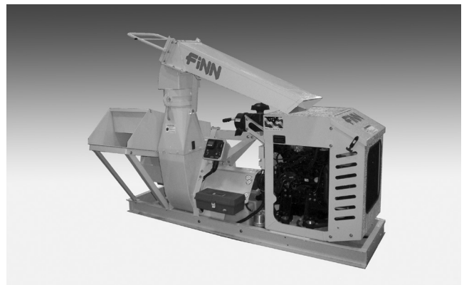
B70, Right Hand Feed, Straw Blower Skid Mounted. (B70S)

As the world leader for over 70 years in the design and manufacture of innovative, quality equipment for the erosion control industry, FINN Corporation is committed to your complete satisfaction.