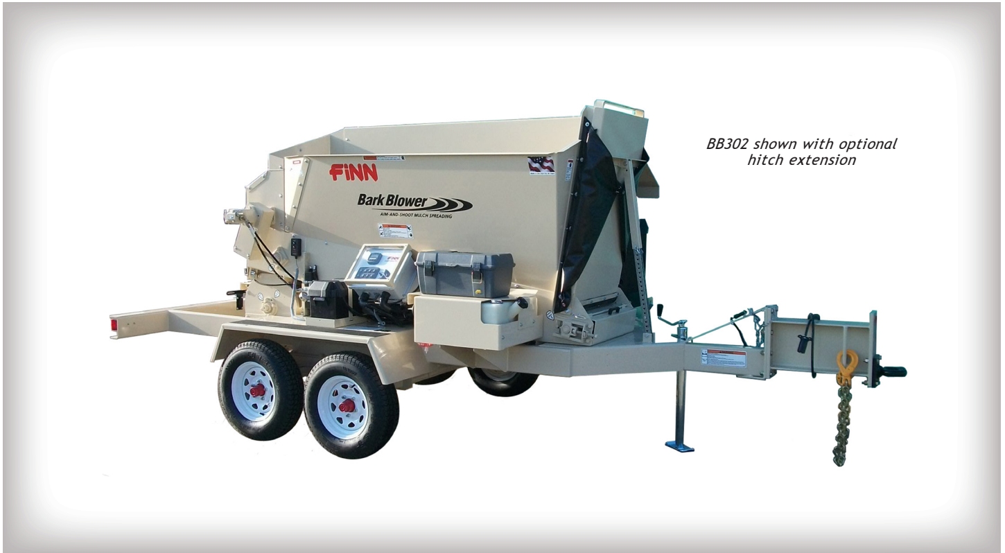
BB302 shown with optional hitch extension

The FINN BB302 Bark Blower applies landscape mulch and other bulk materials with unprecedented efficiency, and eliminates the need for labor-intensive hand application. The 1.5 cubic yard hopper is perfect for smaller jobs and hard to reach areas.